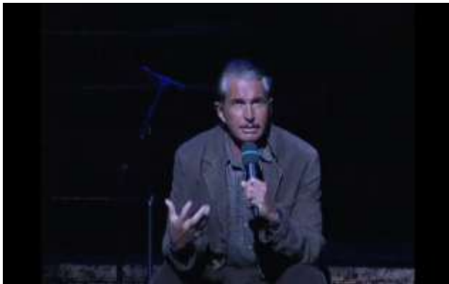
George Hamilton, Broadway and Film Actor, speaks at a Chicago Day on Broadway