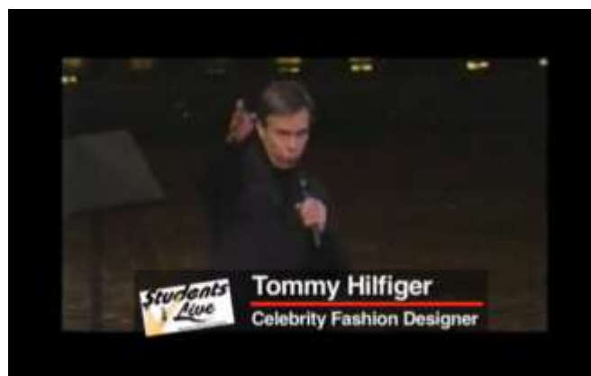
Fashion Designer, Tommy Hilfiger, speaks at a Career Day on Broadway